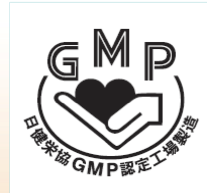
Japanese GMP logo